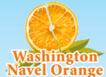
Washington Navel Orange

Tahiti lime will complement its partner on Citrus Splitzer with a good supply of small seedless fruit.